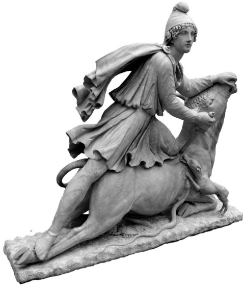
Fig.2. Tauroctony of Mithras at the British Museum London

such a work to be done, not just for the sake of pure knowledge on the past, but for the sake of future either.